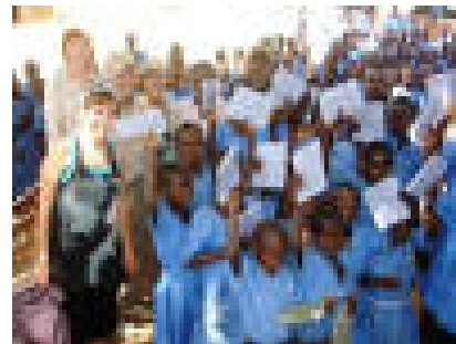
Students with the books